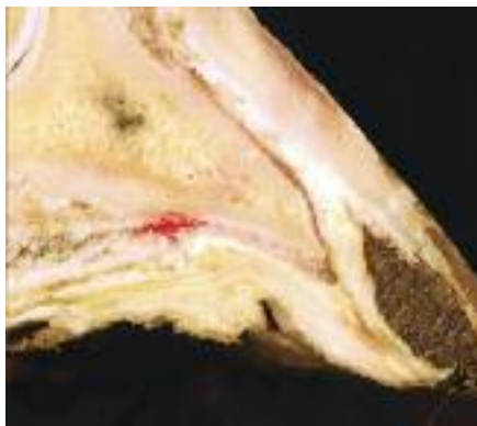
Fig 2. - There can be rather large areas of separation filled with dirt/debris despite maintaining a healthy appearance of the outer hoof wall.

wall that is filled with dirt/debris is noted (Fig. 1). When removing the dirt/debris with a hoof knife or curette, an area of undermined hoof of varying degree is revealed. After the dirt/debris is removed, portions of white/grey powder like hoof wall are typically seen before reaching a healthy margin. There can be rather large areas of separation filled with dirt/debris despite maintaining a healthy appearance of the outer hoof wall (Fig. 2). Lameness is usually only noted when extensive separation has occurred, resulting in an instability of the distal phalanx within the hoof capsule (Fig 3).