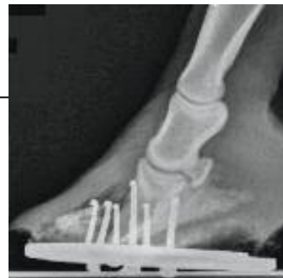
Fig. 3. - Lameness is usually only noted when extensive separation has occurred, resulting in an instability of the distal phalanx within the hoof capsule