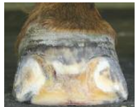
Fig. 8, 9, 10 - A sequence of debridement prior to topical treatment.