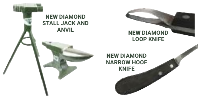
NEW DIAMOND STALL JACK AND ANVIL

Recently, Kerckhaert introduced the new Diamond Tracker horseshoe (right). This shoe features a beveled toe and solid heel area and has been produced in a generic pattern. The steeper bevel in the toe provides good breakover with less chance of slipping and solid heels provide additional support in soft terrain. Compared to the very round shape of the St. Croix Eventer, the Tracker has a more natural shape in the toe and even more so in the branches. Easily shaped into front or hind patterns, the Tracker reduces the number of shoes a farrier needs to carry on their truck and requires less time and effort in shaping for the best fit. The Tracker is quickly making converts out of many Eventer users thanks to Kerckhaert's innovative design and attention to detail.