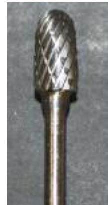
Fig. 7 - Carbide cross cut burrs.