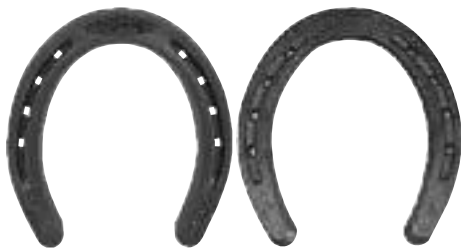
NEW DIAMOND BRONCO PLAIN