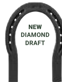
NEW DIAMOND DRAFT