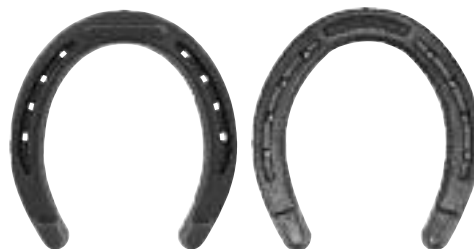
NEW DIAMOND BRONCO TOE AND HEEL