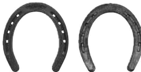
NEW DIAMOND CLASSIC PLAIN