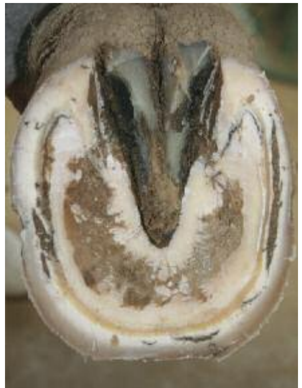
Fig. 1 - Cases of WLD are often first noticed by farriers during routine trimming/shoeing visits. An area of separation in the hoof wall that is filled with dirt/debris is noted.

The cause of WLD has long been debated. Although several theories have been described, none have been proven. The current theory of WLD etiology as described by O’Grady, Moyer and others is that opportunistic, keratinopathogenic microorganisms invade the non-pigmented stratum medium of the hoof wall following an initial separation caused by a mechanical stress or weakness, trauma, abnormal or excessive moisture exposure, or some combination. 1,2 These organisms degrade the keratin in the hoof wall exacerbating the separation. Furthermore, dirt and debris typically fill the separation, acting as a mechanical wedge forcing the wall apart.