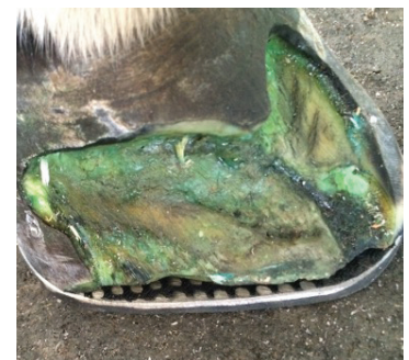
A preventer style medial branch helps ensure the shoe is not stepped on and pulled off.