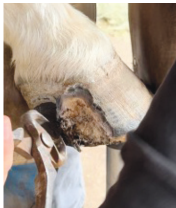
Half-round nippers used in resection and debridement of WLD cavity.