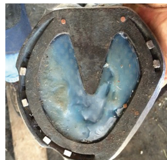
A handmade heart bar shoe and Equi-Pak applied to a foot after a wall resection. The frog support and Equi-Pak aid in weight bearing after lost wall contact.

Hoof stabilization: When a significant portion of the hoof capsule - sometimes as much as two-thirds - must be resected to fully expose and treat white line disease, mechanical stabilization becomes just as critical as antimicrobial therapy. With much of the hoof wall compromised or removed, the structural support that normally bears the horse's weight is greatly diminished. Fortunately, the frog can naturally support up to one-third of the horse's weight, and this load-bearing capacity becomes essential during recovery. A well-fitted heart bar shoe is ideal in these cases, as it transfers weight-bearing responsibility to the frog while simultaneously offloading stress from the damaged or absent hoof wall. This redistribution of load helps maintain hoof function, prevents further mechanical distortion, and supports the regeneration of a stronger, more balanced hoof capsule. In combination with precise trimming and casting or composite materials when needed, heart bars provide vital stability to the weakened hoof wall. While heart bar shoes offer excellent support for compromised hooves, they can present unique challenges - particularly when there is insufficient hoof wall remaining to securely anchor nails. In cases where large sections of the wall are missing due to resection, the farrier must