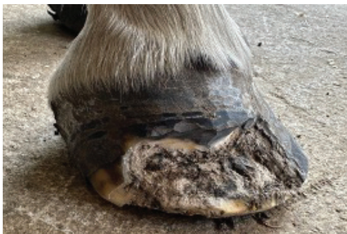
The resected hoof wall prior to casting.