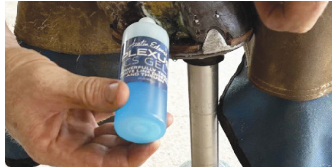
Plexus CS Gel being applied to the leading edge of the WLD to disinfect any undiscovered fissures.

Topical treatments: Antiseptics play a critical role in managing white line disease (WLD), particularly when used in conjunction with mechanical debridement. One of the most effective topicals for treating larger WLD cavities is Plexus CS Gel. After hoof wall resection has exposed the leading edge of the infection, Plexus CS Gel is applied directly to these areas. Its formulation allows it to wick deeply into the hoof wall and white line crevices, delivering antimicrobial action directly to where fungi and anaerobic bacteria are actively colonizing. This targeted delivery helps halt microbial progression, even in hard-to-reach fissures that might have been missed during debridement.