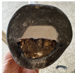
FootPro Cast applied with FootPro DIM 20 in the caudal half of the foot to provide additional support.