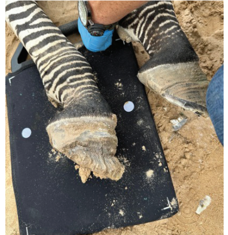
A crack was discovered on a laminitic zebra at a local zoo. After the zebra was anesthetized, a wall resection done after x-rays revealed a large WLD cavity.

Small cavities - Early detection of WLD cavities is key to prevention. If a cavity is small and its margins can be debrided from the solar surface, resection of the hoof wall may not be necessary. First, all flaky tissue should be removed, and if I am certain I have exposed all the leading edges, I may opt to pack the cavity with Allen's Copper Sulfate and FootPro CS Clay. The Allen's CS dissolves during the course of the shoeing cycle and leaches into the hoof wall, disinfecting the fungus and bacteria causing the WLD. The FootPro CS also has antimicrobial properties and holds the