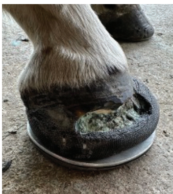
Kerckhaert DF is nailed to FootPro Cast with an aluminum plate. FootPro DIM 20 is applied under the plate for additional solar support.