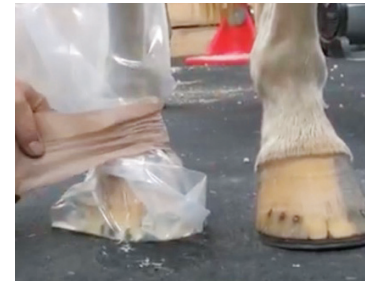
A bag is used for the White Lightning/vinegar mixture for a thorough soak.

Hoof stabilization: When a significant portion of the hoof capsule - sometimes as much as two-thirds - must be resected to fully expose and treat white line disease, mechanical stabilization becomes just as critical as antimicrobial therapy. With much of the hoof wall compromised or removed, the structural support that normally bears the horse's weight is greatly diminished. Fortunately, the frog can naturally support up to one-third of the horse's weight, and this load-bearing capacity becomes essential during recovery. A well-fitted heart bar shoe is ideal in these cases, as it transfers weight-bearing responsibility to the frog while simultaneously offloading stress from the damaged or absent hoof wall. This redistribution of load helps maintain hoof function, prevents further mechanical distortion, and supports the regeneration of a stronger, more balanced hoof capsule. In combination with precise trimming and casting or composite materials when needed, heart bars provide vital stability to the weakened hoof wall. While heart bar shoes offer excellent support for compromised hooves, they can present unique challenges - particularly when there is insufficient hoof wall remaining to securely anchor nails. In cases where large sections of the wall are missing due to resection, the farrier must