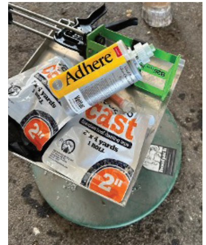
Everything needed on the Hoofjack table for easy reach. FootPro Cast and Vettec Adhere to build a rim cast on the compromised hoof wall.

Prevention: Prevention of white line disease begins with vigilance during every trim or shoeing cycle. At each visit on WLD prone horses, the farrier should carefully inspect the white line for any signs of separation, cavities, or chalky, decaying material - early indicators of microbial invasion. When potential cavities are identified, they must be thoroughly debrided to remove compromised horn and expose clean, healthy tissue. I start by applying Plexus CS Gel directly into the cavity, allowing it to wick into the hoof wall and target hidden pathogens. After that, I pack the area with Allen's copper sulfate and FootPro CS clay. Whether applied under a shoe or to a bare foot, this combination offers both antimicrobial protection and a physical barrier, helping halt white line disease before a deeper or more extensive cavity can take hold. Consistent maintenance and early intervention are key to keeping the white line intact and the hoof strong. ■