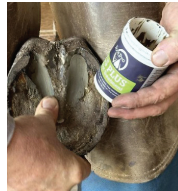
Packing area with FootPro CS Plus and Allen's Blue Powder for WLD prevention.