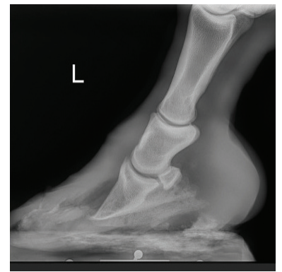
X-ray showing the extent of the cavity.