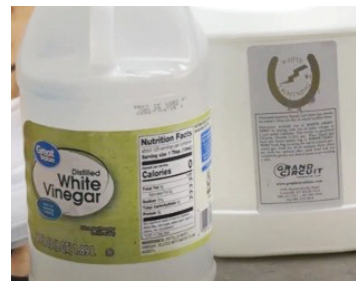
White Lightning mixed with vinegar works great to disinfect the entire foot.

Whole-foot treatment: treatment with Grand Circuit's White Lightning is an excellent option for both treating and preventing white line disease, especially in cases where multiple cavities or extensive infection are present. When used in a gas form under a hoof soak or boot, White Lightning penetrates deeply into every nook, cranny and crevice of the hoof capsule, reaching and disinfecting areas that may not be visible during routine trimming or debridement. This allows for comprehensive antimicrobial action throughout the hoof, targeting hidden pockets of infection and reducing the risk of recurrence. When the full hoof is compromised or when isolated treatment isn't practical, this method ensures nothing is missed.