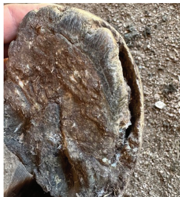
A chronic laminitic horse with a large WLD cavity prior to resection.